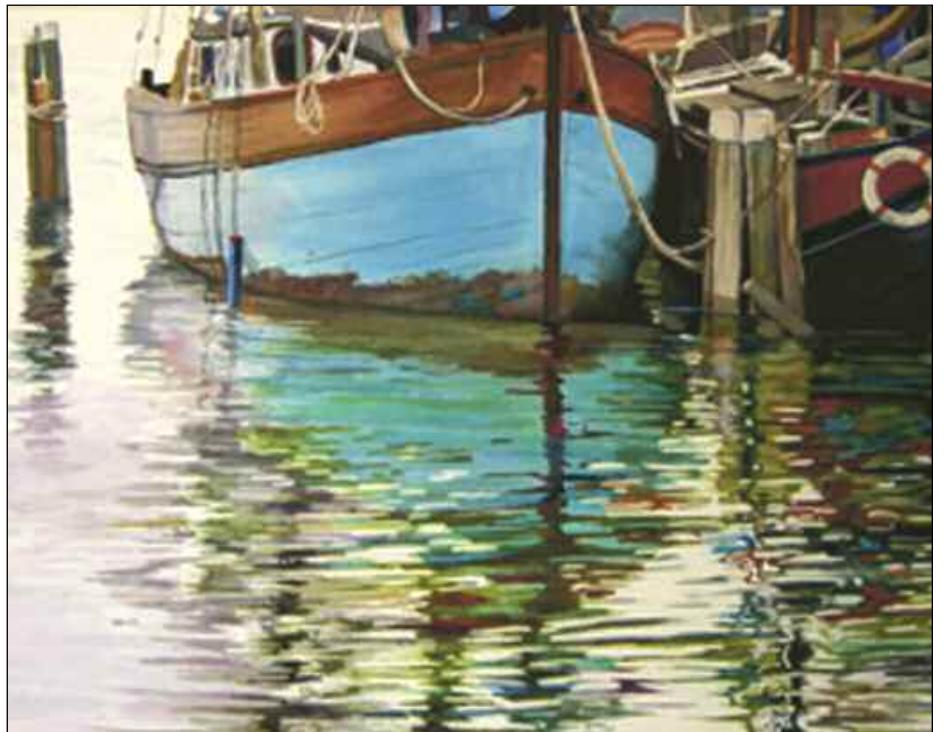
Anne Fallin - Blue Boat In Dutch Waters