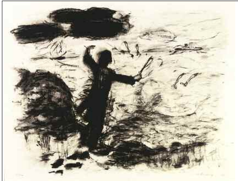
By Susan Rothenberg