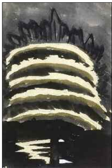
By Charles Burchfield

York, he has authored numerous essays and articles on art/design associated with the region.