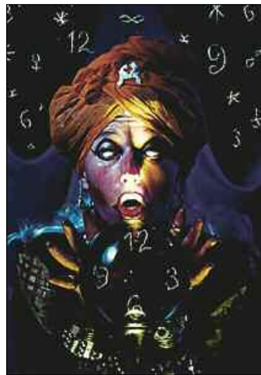
By Cindy Sherman

Mead is also an appointed member of the Buffalo Arts Commission, he serves on several boards and art committees in the region and frequently juries local and national exhibitions. As a leading authority on Western New