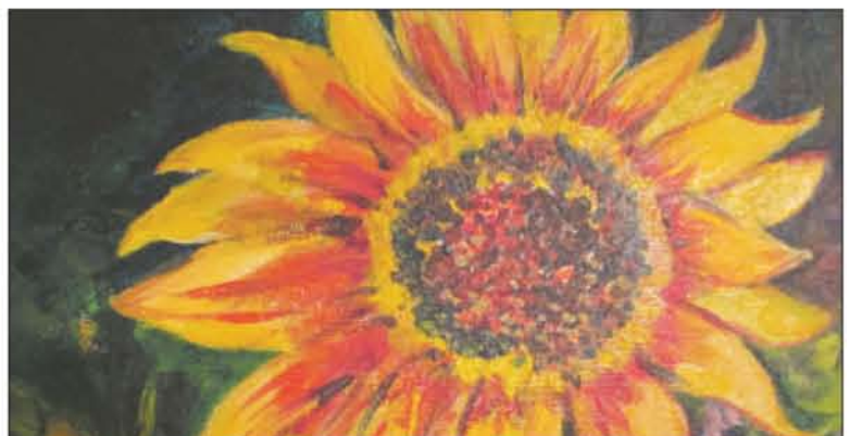
Sunflower