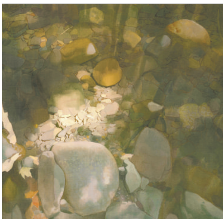
Alex Losett- Trapped-Light, 30x32 oil-on-canvas Minimal Landscapes Series