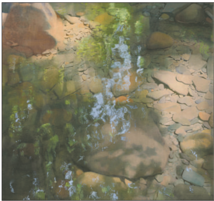
Alex Losett- Cobble Creek, 30x32, oil-on-canvas Minimal Landscapes Series