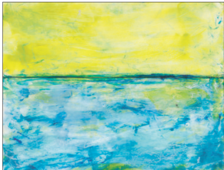
Labovitz-Lake Superior II, 24 x 30, acrylic on canvas, 2012

luxuriating in the touch of moss underfoot and marveling at the soft forest shadows..." Ms. Losett's website holds much more information and many more images: www.losett.com